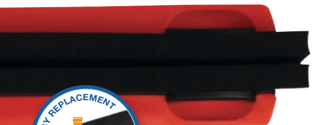
Classic double bladed